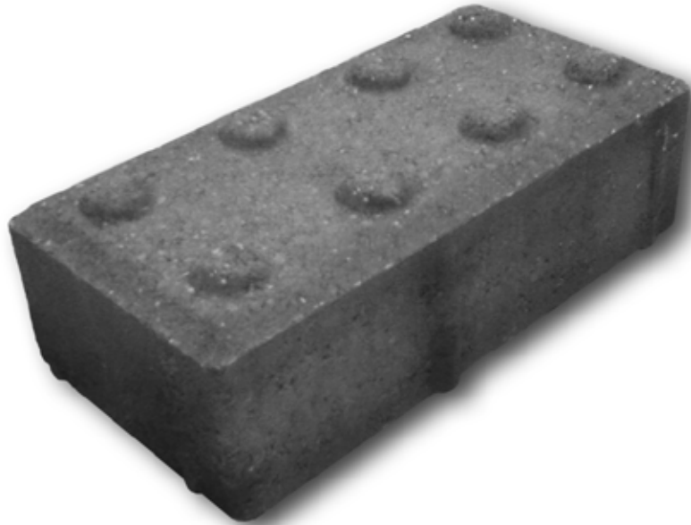
Nominal Dimensions: 4" x 8" x 2 3/8"