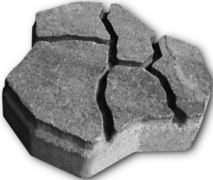
Nominal Dimensions: 12" x 11" x 2 3/4"