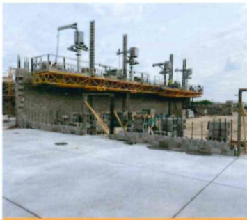
Schools & Storm Shelters