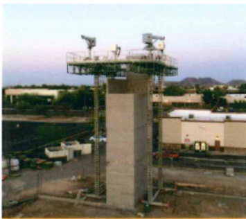
Stair Towers/ Elevator Shafts