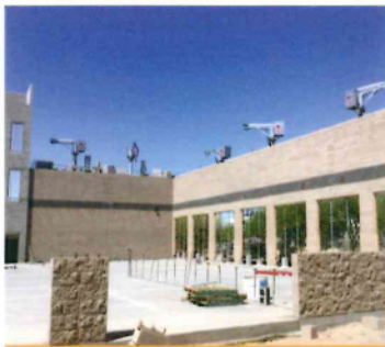
Warehouses & Storage