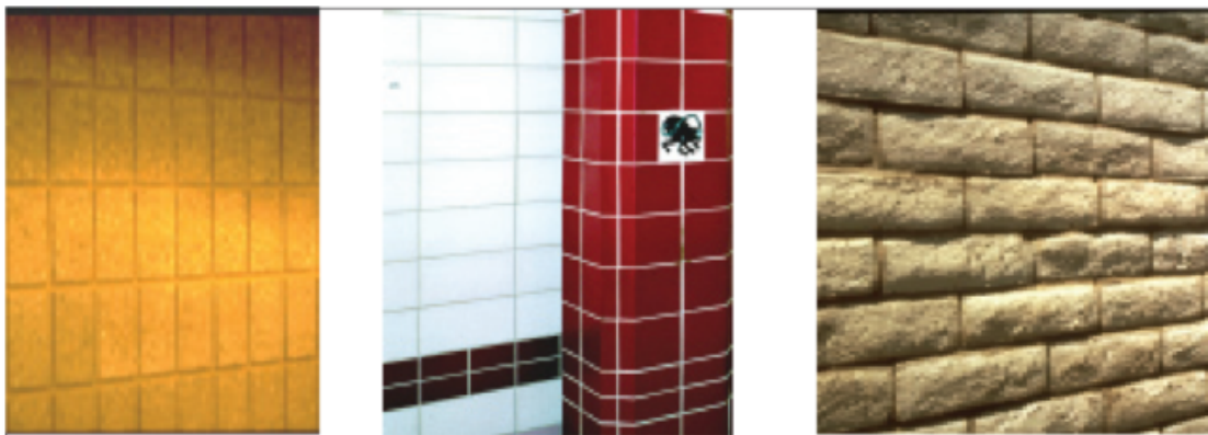
📷 Figure 2—Additional Examples of Architectural Concrete Masonry Units