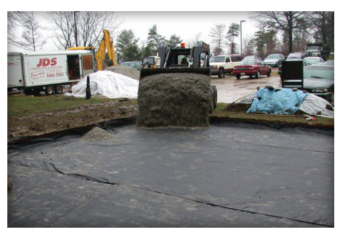
Figure 3. Application of the geotextile under aggregate base.

During and after excavation, the soil should be inspected