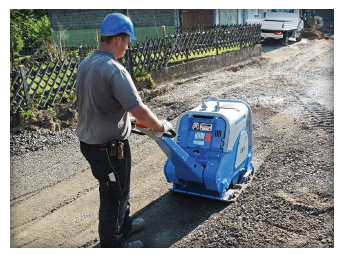
Figure 4. Base compaction with a reversible plate compactor.

geotextiles prevent the migration of soil into the aggregate base under loads, especially when saturated, thereby reducing the likelihood of rutting. When geotextiles are used they preserve the load bearing capacity of the base over a greater length of time than placement without them. Woven or non-woven fabric may be used under the base with a maximum apparent opening size of 0.60 mm as testing using ASTM D4751. Table 2 lists minumum requirements of geotextiles for soil separation. These requirements are from AASHTO M288 Standard Specification for Geotextile Specification for Highway Applications (AASHTO 2015). The minimum down slope overlap should be at least 12 in. (300 mm). Overlap requirements for low strength subgrades are detailed in Table 3.