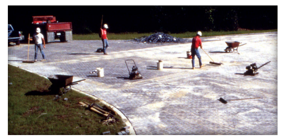
Figure 12. Removing excess sand from the finished surface will make the pavement ready for traffic.

Cut pavers should be used to fill gaps along the edge of the pavement. Pavers are cut with a double bladed splitter or a masonry saw. See Figure 8. A saw gives a smooth cut. All saws should have equipment to reduce the dust created, since it is know to contain high level of respirable crystaline