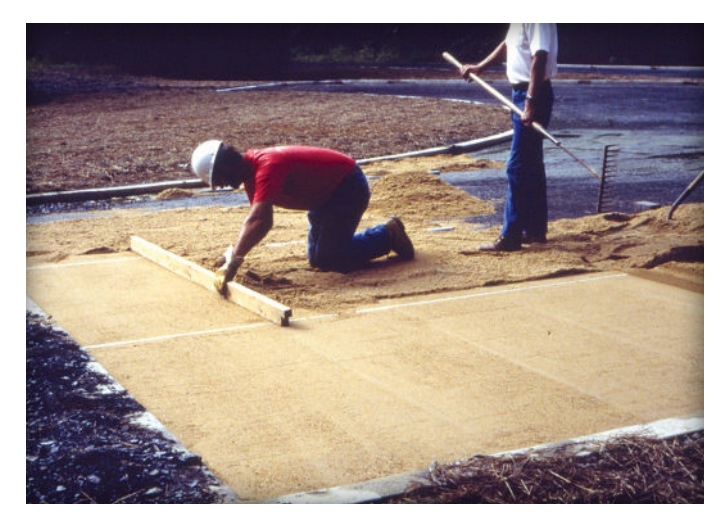
Figure 6a & 6b. Screeding the bedding sand.

with numerous freeze-thaw cycles, expansive soils, or very cold climates. A qualified civil engineer familiar with local soils and traffic conditions should be consulted to determine the appropriate base thickness for streets and heavy-duty, industrial pavements.