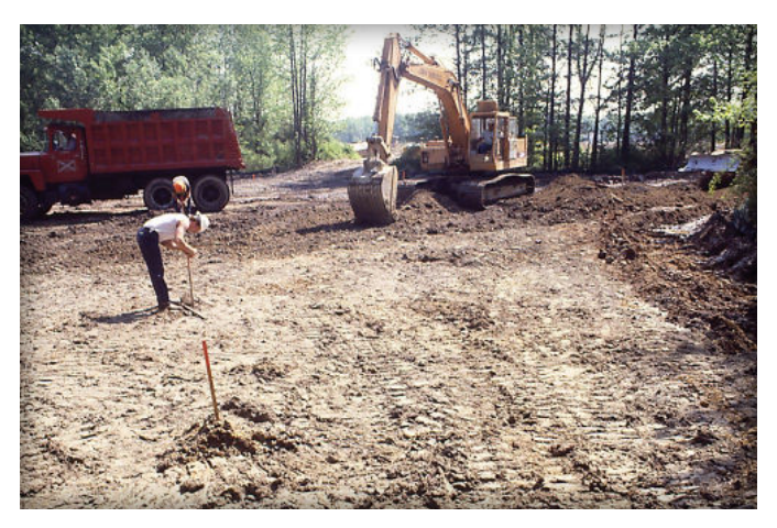
Figure 1. Excavation of the soil subgrade and placing grade stakes.

Concrete pavers made in Canada are required to meet requirements set forth by the Canadian Standards Association CSA-A231.2 Precast Concrete Pavers . This standard requires a minimum average cube compressive strength of 7,250 psi (50 MPa) or 5,800 psi (40 MPa) at delivery. Samples must meet dimensional tolerances for length and width of -1 to +2 mm and height at \pm 3.0 mm. Freeze-thaw durability is tested while samples are immersed in a 3% saline solution and subject to -15 degrees C as the lowest temperature. Samples must have