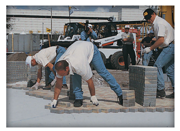
Figure 7. Placing the concrete pavers.

Like compaction of the soil subgrade, adequate compaction of the base is critical to minimizing settlement of interlocking concrete pavements. See Figure 4. Special attention should be given to achieving compaction standards adjacent to edge restraints, catch basins and utility structures. When spread and compacted, the aggregate base should be at its optimum moisture. Bases for pedestrian areas and residential driveways should be compacted a minimum 98% of standard Proctor density. For vehicular areas, compaction should be at least 98% of modified Proctor density as determined by ASTM D1557, or AASHTO T180. While the highest percentage compaction (100%) is preferred, it may not be achievable on weak or saturated soils. Density measurements of the compacted base should be made with a nuclear density gauge or other methods approved by the local, state or provincial transportation department. See Figure 5. Unless otherwise specified, the compacted thickness of individual lifts should be +3/4 in. to -1/2