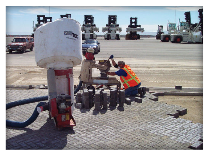
Figure 8. Saw cutting pavers.