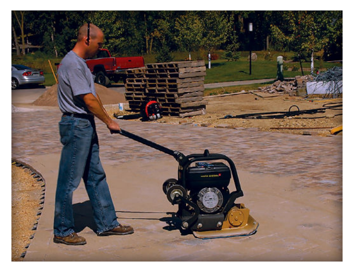
Figure 11. Vibrating sand into the joints.