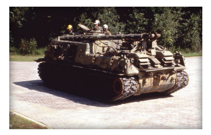
Figure 13. The completed paved area from Figure 12 receives tank traffic at the U.S. Army Proving Grounds in Aberdeen, Maryland.

Dry joint sand is spread into the joints and the pavers compacted again until the joints are full. See Figures 10 and 11. This may require two or three passes of the plate compactor. If the sand is wet, it should be spread on a clean, hard surface to dry before being spread on the pavers and compacted into the joints. Joint sand may be finer than the bedding sand to facilitate filling of the joints like a sand meeting ASTM C144 or CSA A179 requirements. See Table 6. Bedding sand also can be used to fill the joints, but it may require extra effort in spreading and compacting. Compaction should be within 6 ft (2 m) of an unrestrained edge or laying face. All pavers within 6 ft (2 m) of the laying face should have the joints filled and be compacted at the end of each day. Excess sand is then removed. See Figure 12. The remaining uncompacted edge can be covered