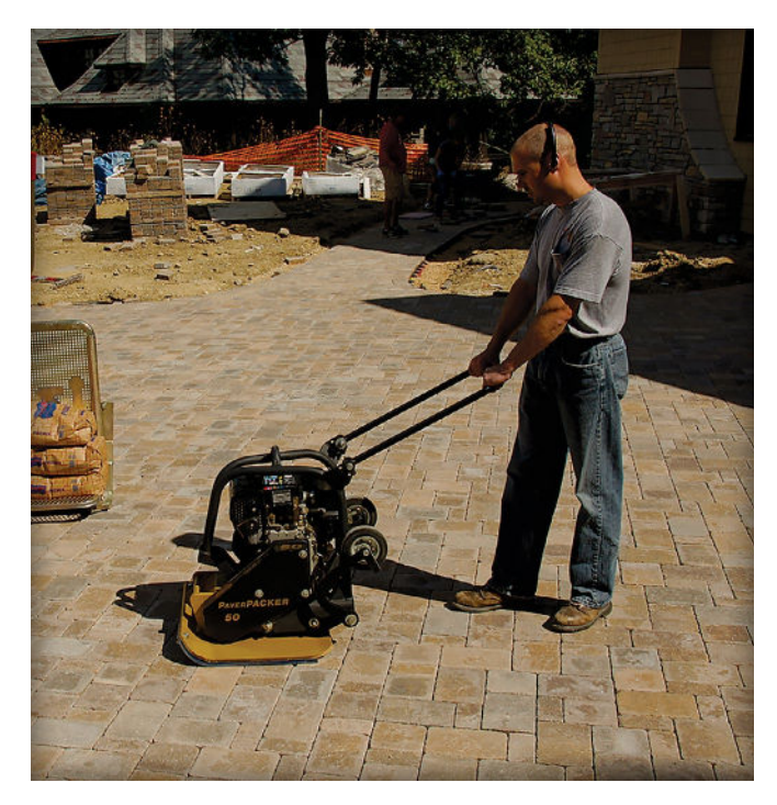
Figure 9. Compacting the pavers and bedding sand.

in. (+19 mm to -13 mm). Maintaining consistent lift thickness during compaction will help achieve consistent density. Variation in final base surface elevations should not exceed ±3/8 in. (± 10 mm) when tested with a 10 ft. (3 m) straightedge.