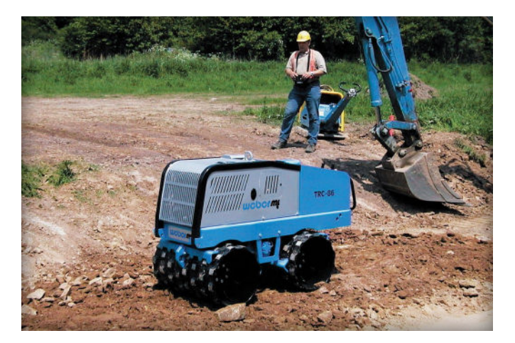
Figure 2. Compacting the soil subgrade.

an average mass loss no greater than 225 g/m<sup>2</sup> when subject to 28 freeze-thaw cycles, or no greater than 500 g/m<sup>2</sup> when subject to 49 freeze-thaw cycles.