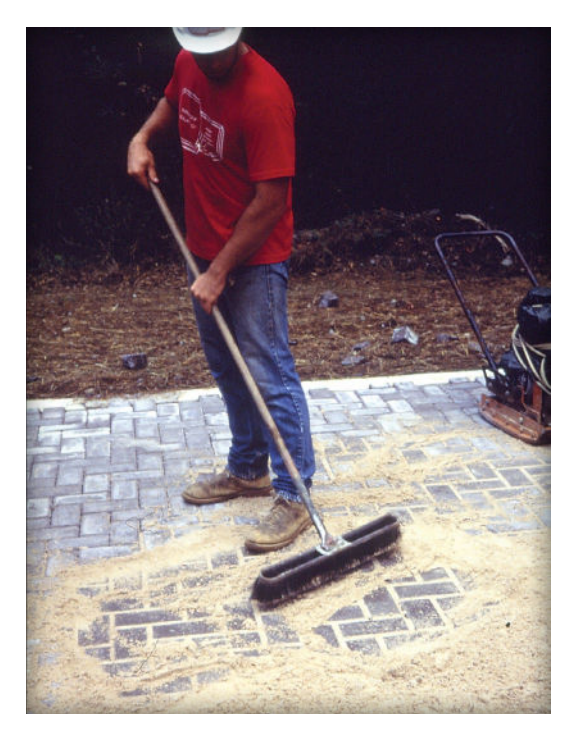
Figure 10. Spreading the joint sand.

Edge restraints are a key part of interlocking concrete pavements. By providing lateral resistance to loads, they maintain continuity and interlock among the paving units. Aluminum, steel, plastic, or concrete are typical edge restraints. Consult CMHA Tech Note PAV-TEC-003 on edge restraints for recommendations on applications and construction.