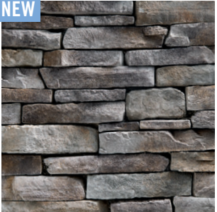
Pebble Creek™ Ledgestone