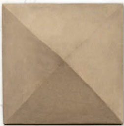
Pier Cap 26"w × 26"l × 2.5"–5.5"h