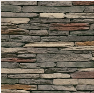
Tennessee Laurel Cavern Ledge