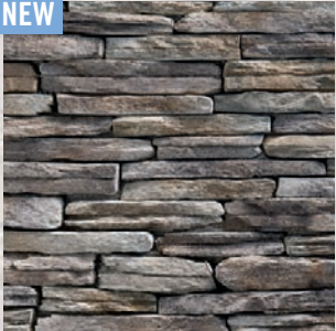
Pebble Creek™ Laurel Cavern Ledge