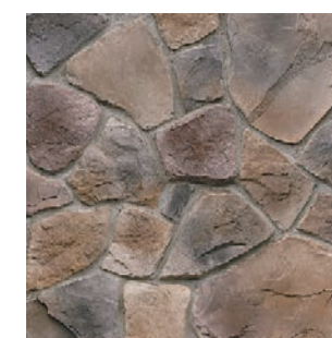
Valley Forge Fieldstone