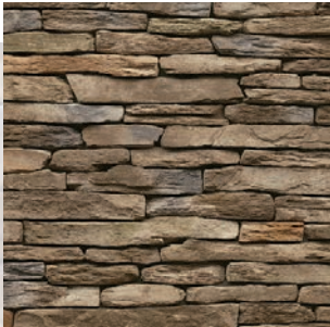
Asher Laurel Cavern Ledge