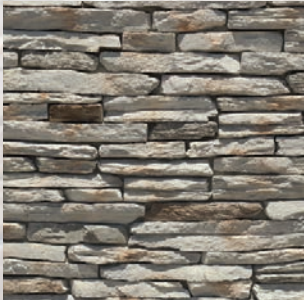
Hamilton Laurel Cavern Ledge