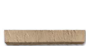
Wainscot Sill 20"w × 3"h × 1.5"d