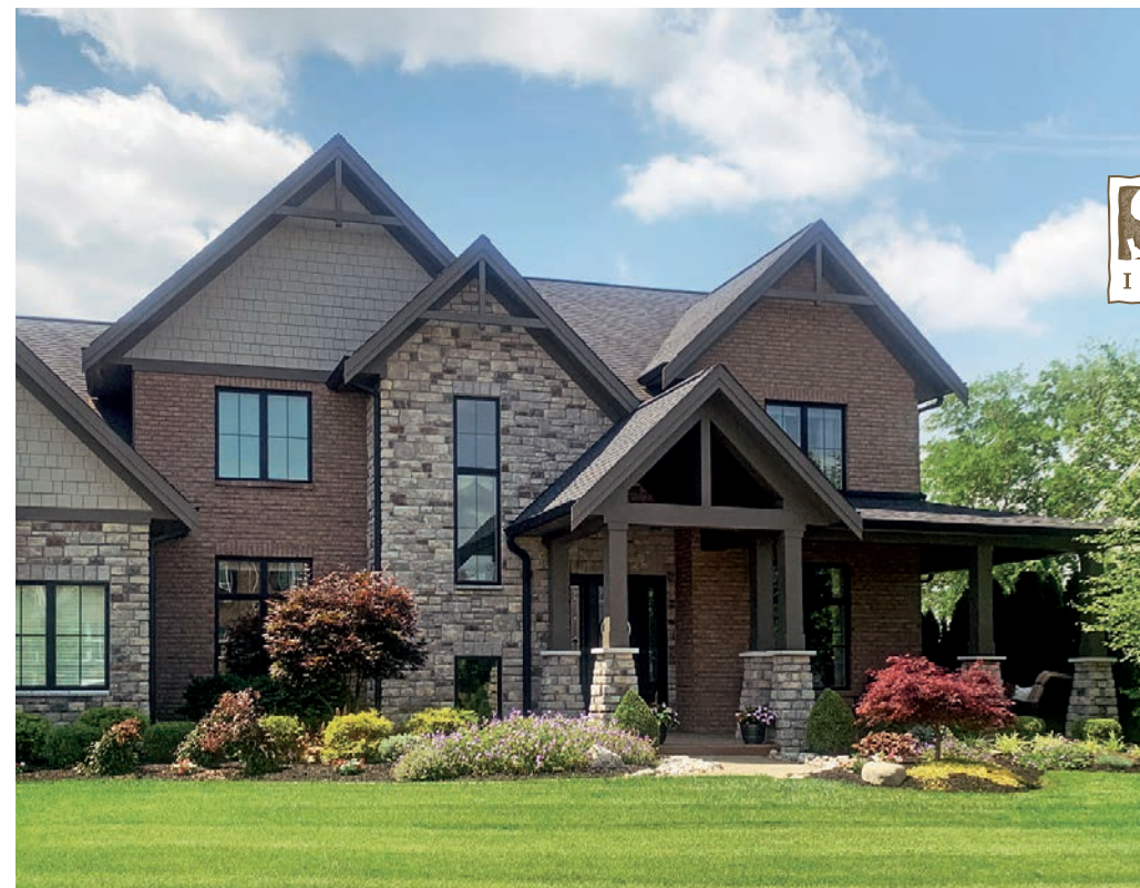
Heritage in Hamilton