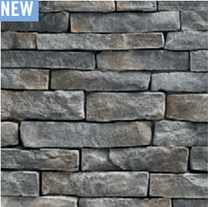
Steel Valley™ Ledgestone