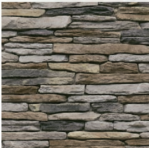
Pennsylvania Laurel Cavern Ledge