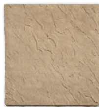
Hearthstone 19"w × 20"l × 1.5"h