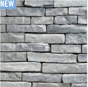
Silver Summit™ Ledgestone