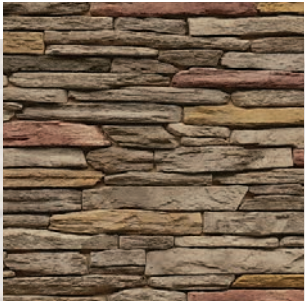
Chardonnay Laurel Cavern Ledge