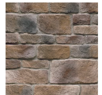
Valley Forge Cobble