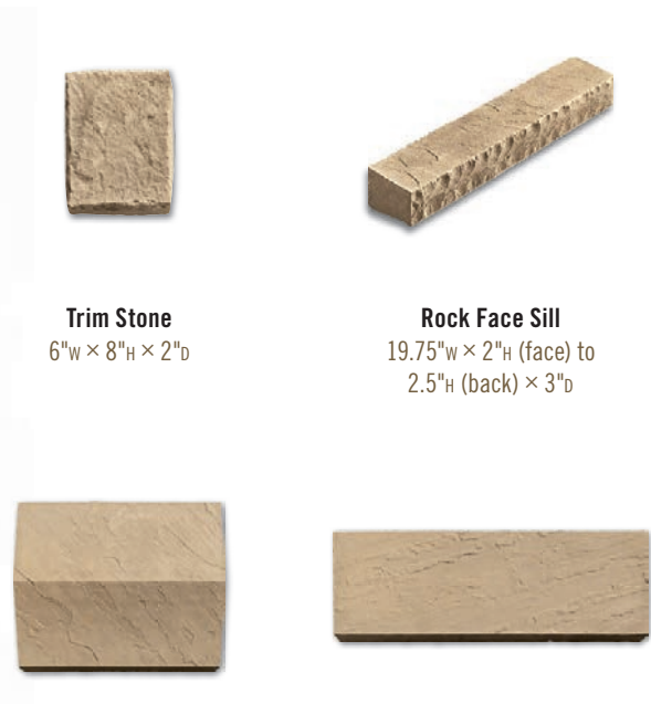
Trim Stone 6"w × 8"h × 2"d