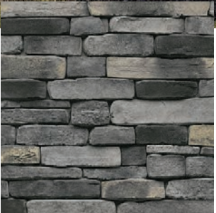
Kingsford Grey Ledgestone