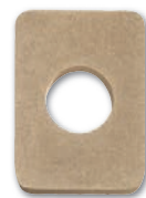
Light Box 8"w × 11"h × 1.5"d