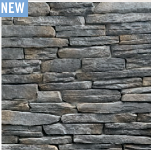
Steel Valley™ Laurel Cavern Ledge