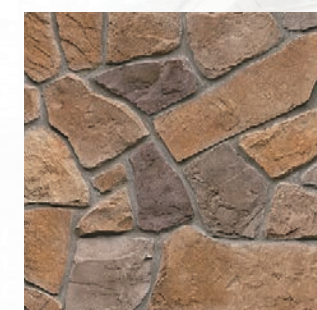
Warm Springs Fieldstone