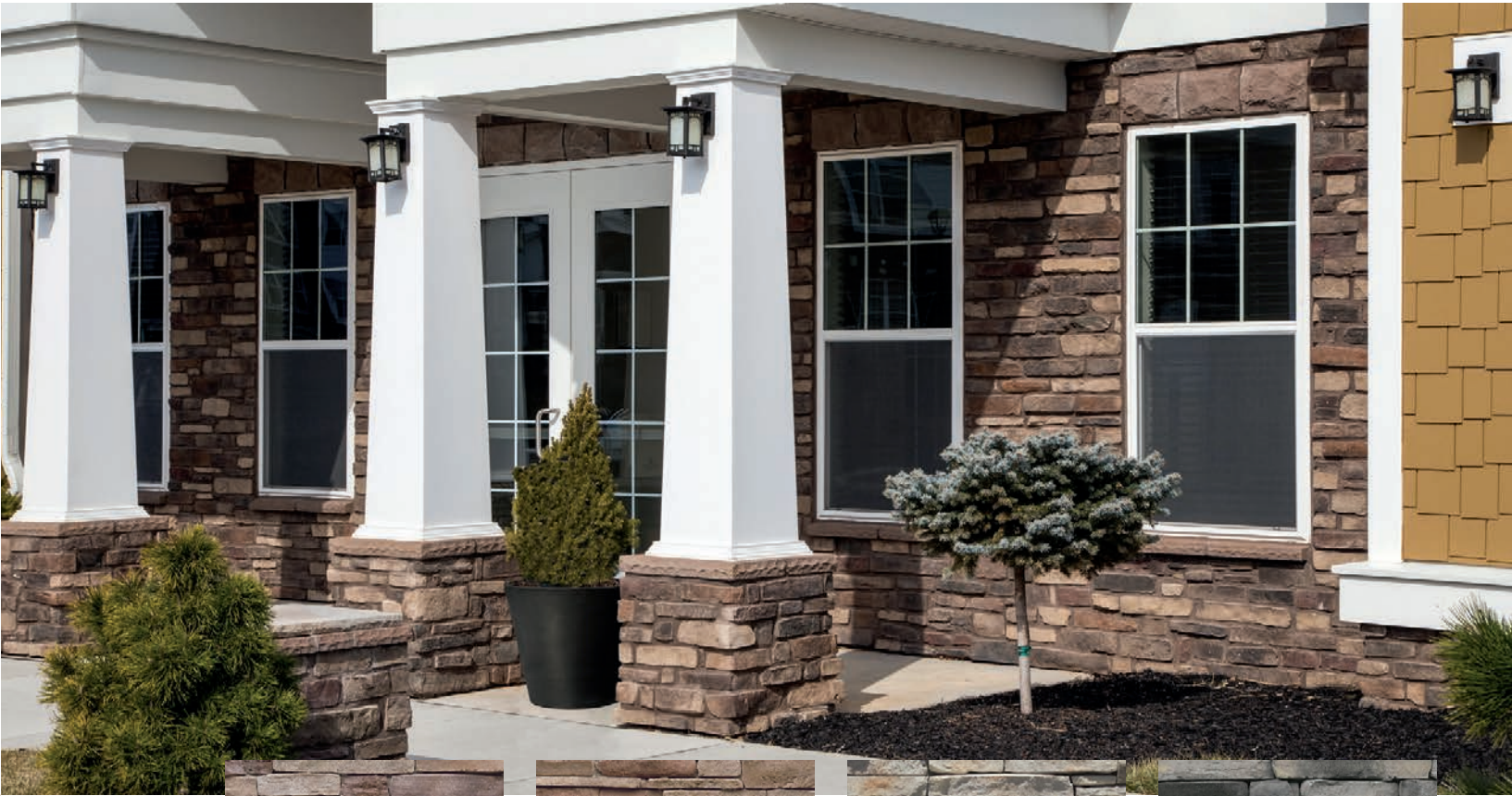
Ledgestone in Tennessee