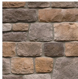
Warm Springs Heritage