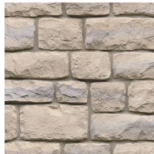
Old Ohio Heritage