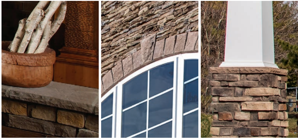
Hearthstone in Grey Keystone & Trim Stones in Espresso Flagstone Wall Cap in Espresso