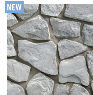
Silver Summit™ Fieldstone